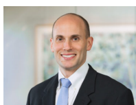
Michael B. Dell