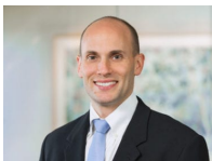
Michael B. Dell