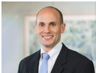
Michael B. Dell